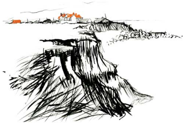
Black and Red Study II. This drawing in charcoal and pastel is by Norwich artist Malca Schotten. It shows the new bay near the car park in Happisburgh in 2010, before the creation of the ramp.